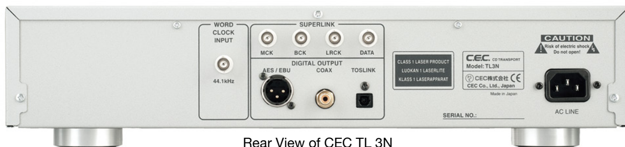
Rear View of CEC TL 3N

the DA3N. The finish of both devices is excellent. The considerable weight - the drive weighs eleven kilograms and the D/A converter nine - indicates the outlay that has gone into the materials. Incidentally, for over a year CEC has been doing its development and production exclusively in Japan, after the relocation of production to China resulted in some bad experiences. „The high-quality drives were always made in Japan anyway and are probably the longest-lasting CD drives in the world,“ says Rolf Braun from the German sales department, adding: „We can even repair twenty-year-old devices and update them to state of the art technology - we see this as a good, indeed important argument for our customers.“ Future compatibility as a plus point. But for the moment, we are talking about the new DA3N D/A converter. Moving the big, left-hand control dial, the display shows the currently selected input. Also at the left on the front panel there are connections for a TOSLINK mini-plug and a USB cable with mini-B connector. Very practical! To the right of the display you then have the second big knob